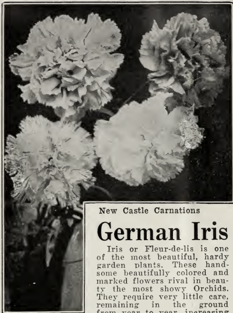
New Castle Carnations